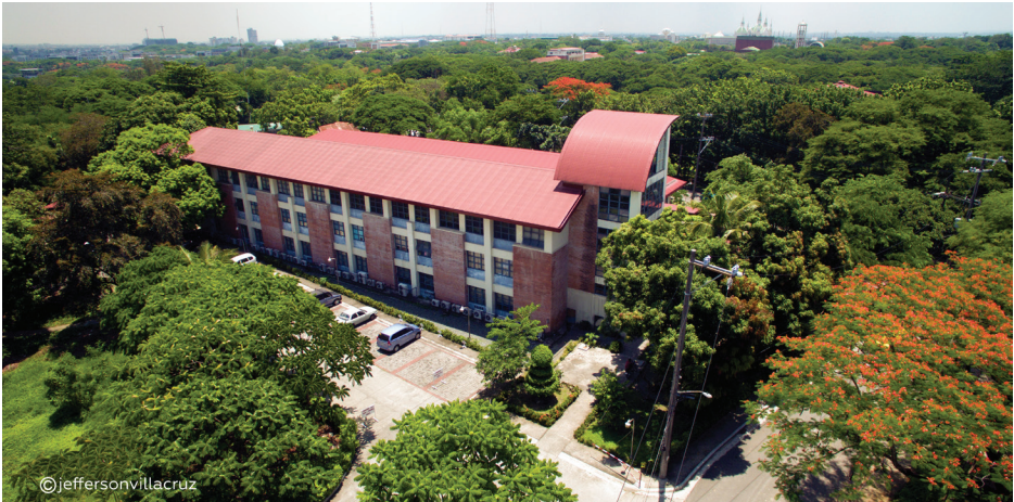
Aerial view of Office of the University Registrar

T he Office of the University Registrar (OUR) is a vital arm of UP Diliman. Its specific role is to provide accurate, validated, authenticated information, documentation, advice and critical support and other services related to academic programs and degree requirements. It is a main player during enrollment, and is a keeper of permanent academic records and other credentials for a variety of student concerns. As official recorder, it serves as Secretariat in the different administration committees like the Executive Committee, Curriculum Committee, Committee on Student Progress, Admission and Graduation, and in University Council (UC) meetings. It is also the Steering Committee of the University Council Committees.