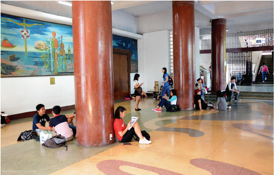
Palma Hall Lobby