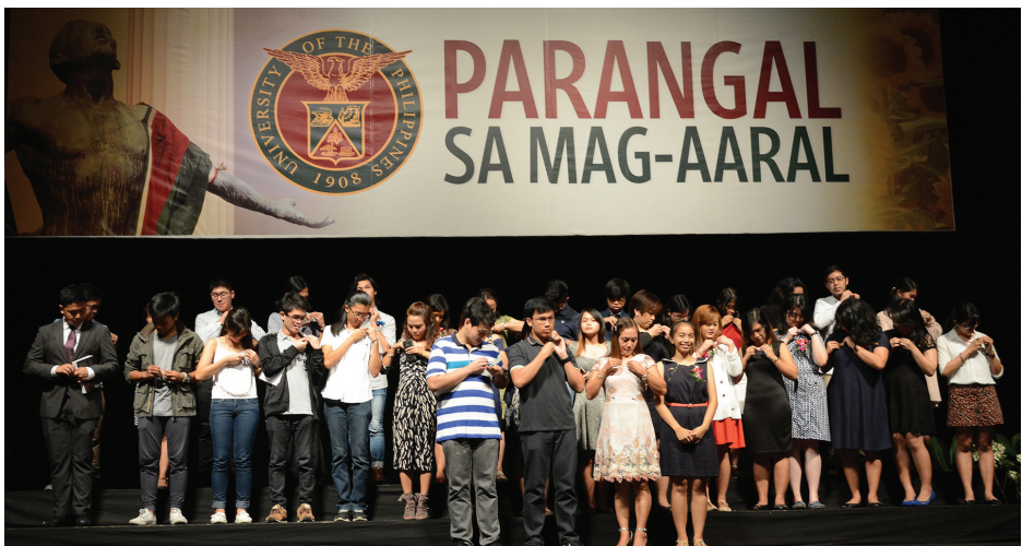
Parangal para sa mga Mag-aaral 2017

The effectivity of the scholarship is for the semester when such weighted average is obtained.