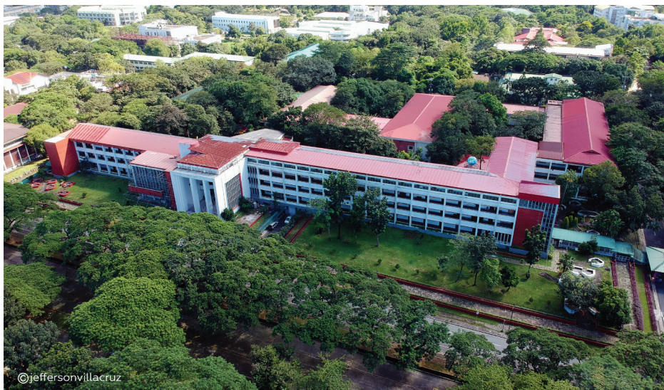
Aerial view of Palma Hall