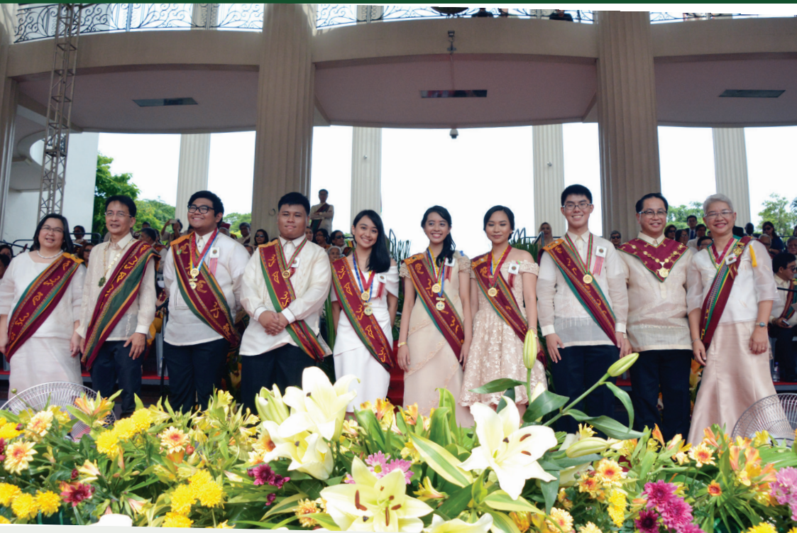
107 th General Commencement Exercises

Students who complete their courses with the following ABSOLUTE MINIMUM weighted average grade shall be graduated with honors: